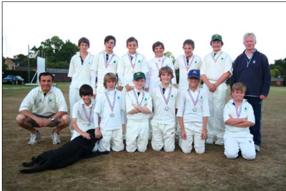
Rowledge U13 team: Runners Up in County Final

The Surrey semi-final was played at Stoke d'Abernon with Rowledge winning with four overs to spare. That's where the good fortune ran out. On Tuesday 6th July, our Under 13's stars lost the County Final to Spencer by 6 wickets. Meanwhile, the under 13's Academy squad team lead zone B, undefeated, in the Two Counties League.